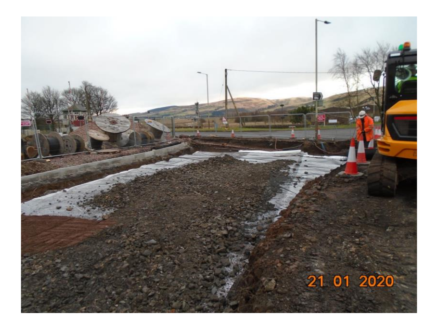
Site Entrance Works