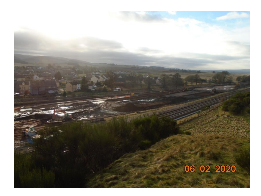
Overview of Works