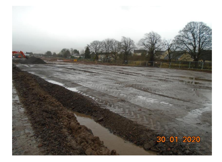
Bulk Earthworks – Area 2