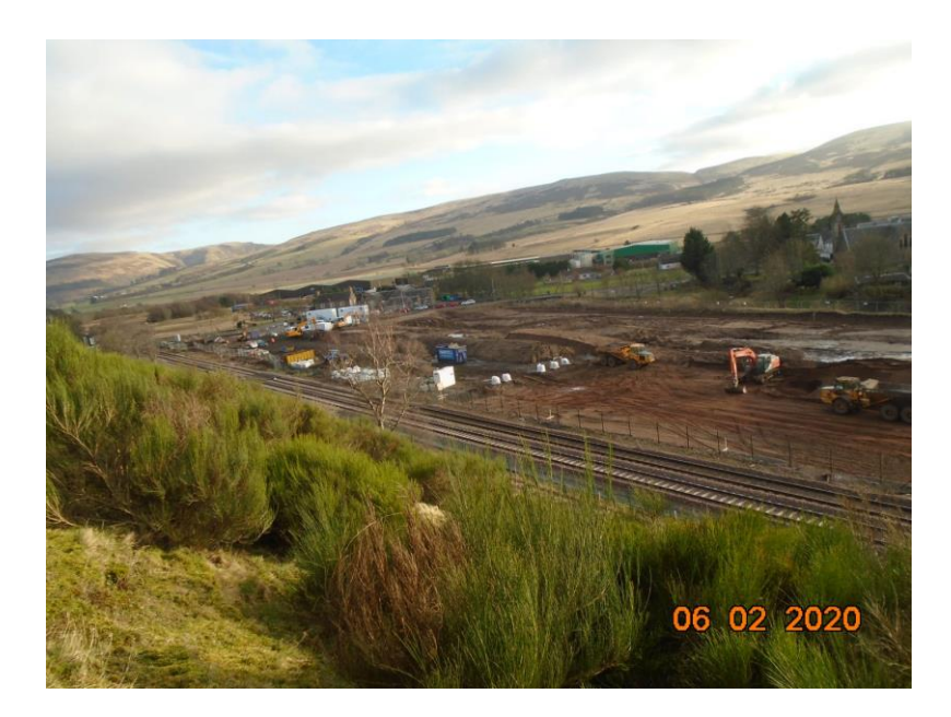
Overview of Works